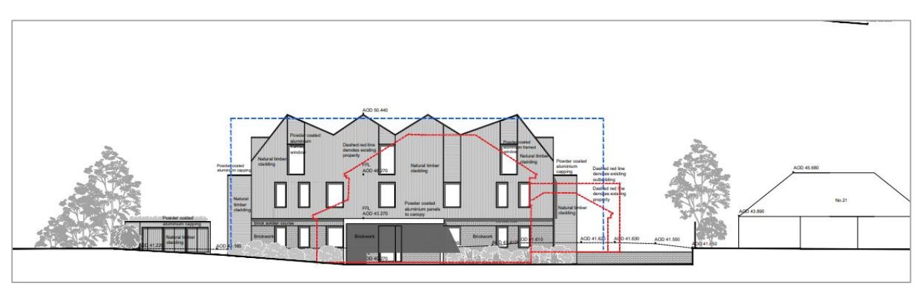
Figure 4 Proposed front (northern) elevation