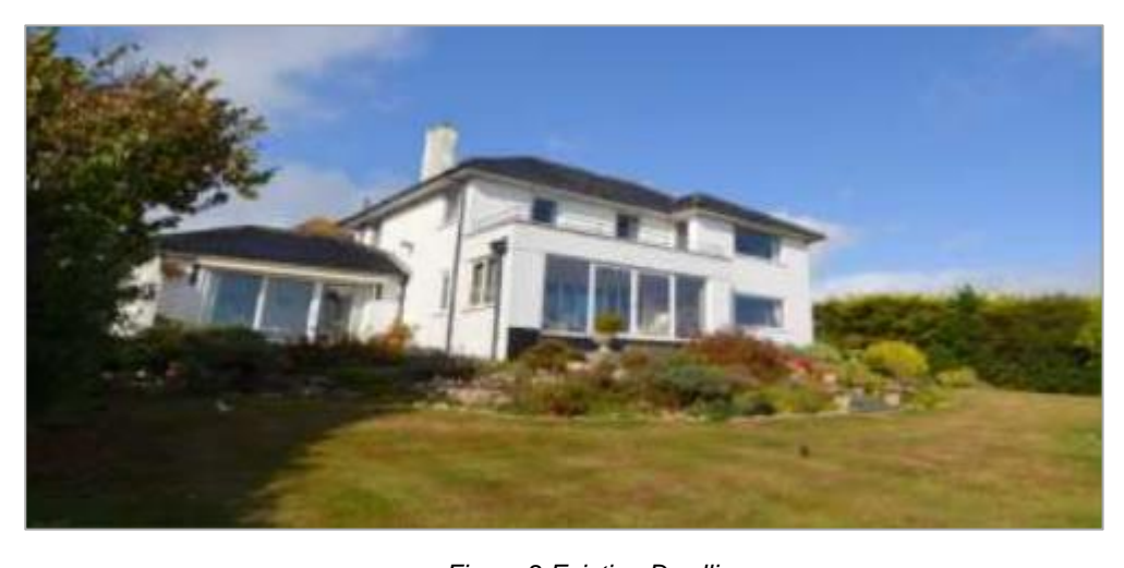
Figure 2 Existing Dwelling