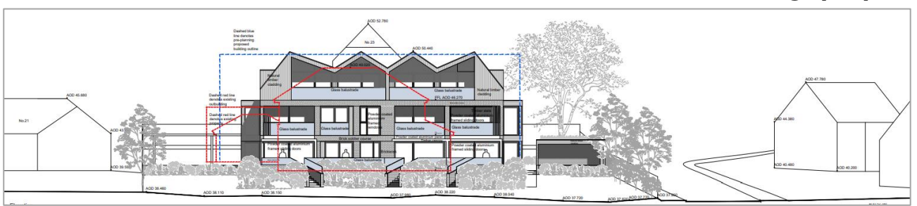
Figure 5 Proposed rear (southern) elevation